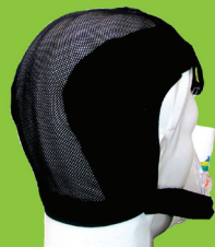
Full Cap Head Gear